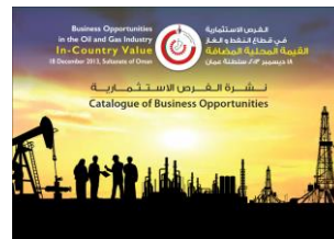
Catalogue of opportunities